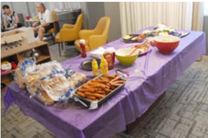
The Lunch Spread at the NC Jaycees Mid-Year Convention.