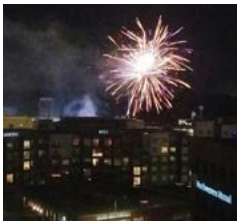
A scene from the Fireworks display coming from the Greensboro Grasshoppers Game downtown.