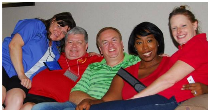
Fun in the Hospitality Suite!