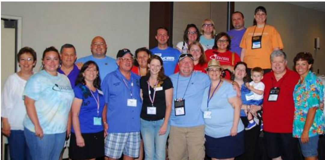
Senators enjoying hospitality