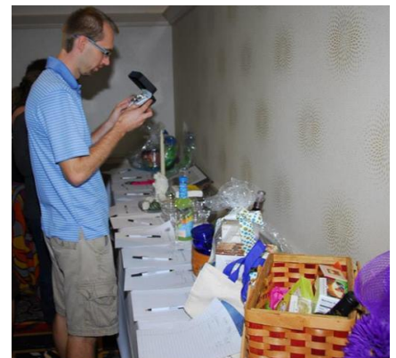
A JC checking out the Silent Auction before bidding