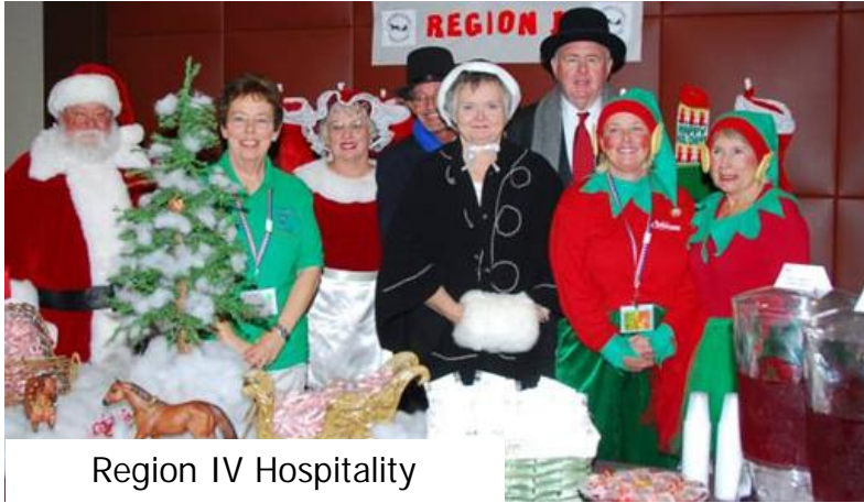
Region IV Hospitality