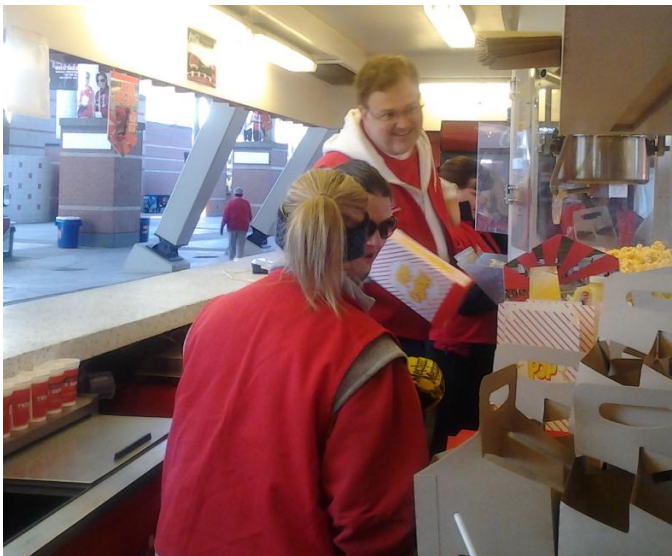
Senators working the Cary JCs Concessions during the 2013 football season