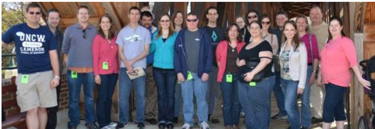
Enjoying JC Regional Day in Old Salem with Jaycees from across the State