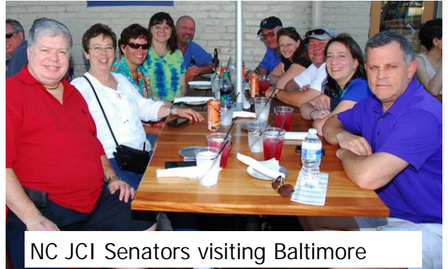
NC JCI Senators visiting Baltimore