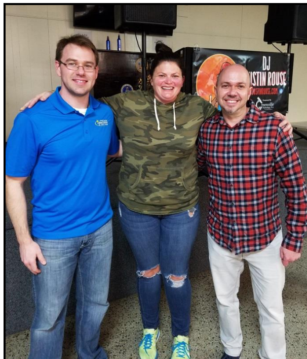
Shuck & Pluck 2020 Greenville Jaycees