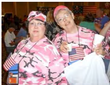
2012 Regions Party at US Senate Year End Convention