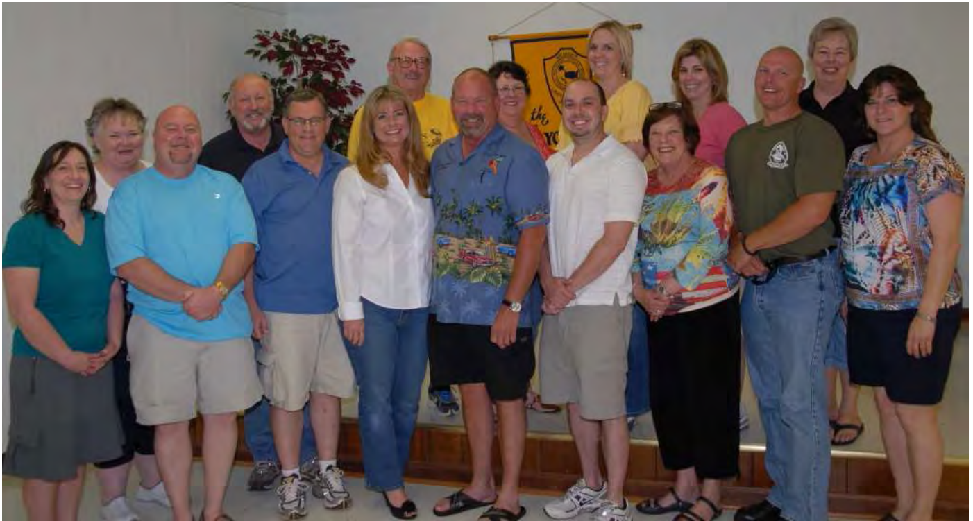
The 2012-2013 NC JCI Senate Team June 2 Board Meeting—NC Jaycee Headquarters