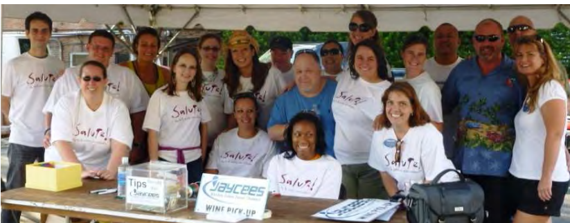
2012 Shots: Salute Wine Festival, NC Senate Meeting, Burn Center Visitation